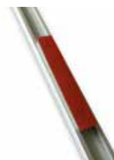
Mounting bracket at the back of LED