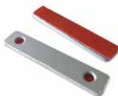
Mounting bracket w/double adhesive